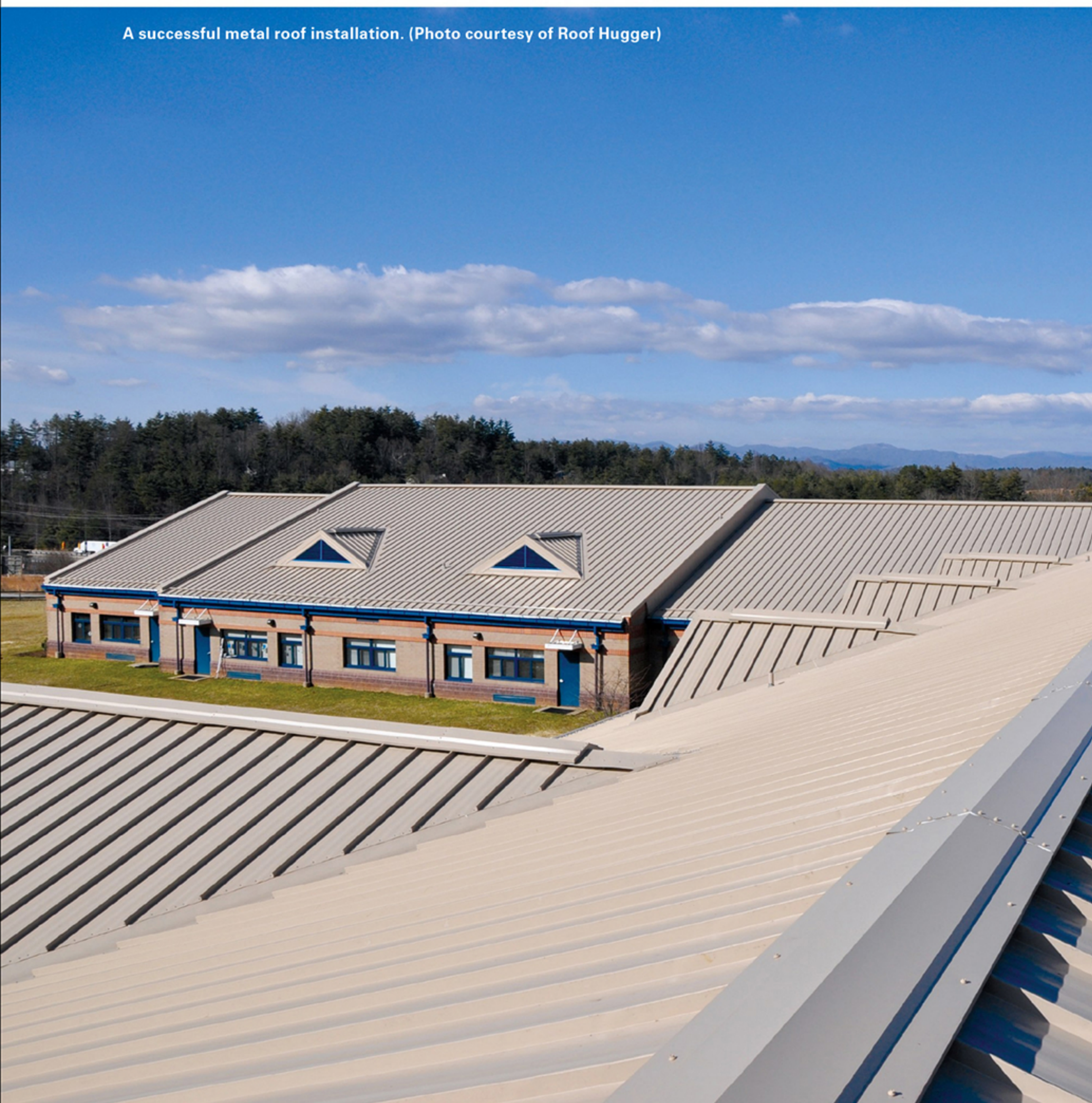
A successful metal roof installation.

chosen metal roof will not be cost effective. "Select a roof with more-than-adequate testing results, performance characteristics and history."